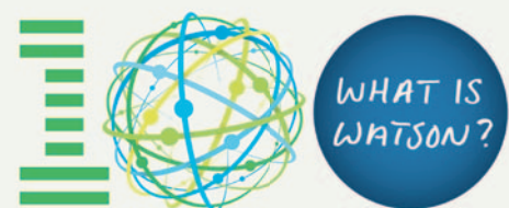
2011 A computer called Watson wins Jeopardy!®